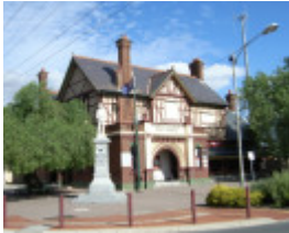
WARRACKNABEAL POST OFFICE SOHE 2008