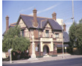
1 post office scott street warracknabeal front view mar1998