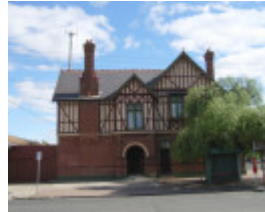
WARRACKNABEAL POST OFFICE SOHE 2008