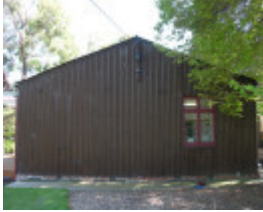
THE WALMSLEY HOUSE SOHE 2008