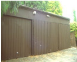
10 walmsley house royal park march 2001