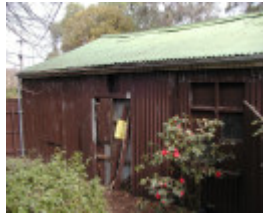
h01946 walmsley house cnr royal parade and gatehouse st parkville side she project 2004