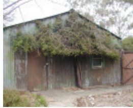
h01946 1 walmsley house cnr royal parade and gatehouse st parkville door she project 2004