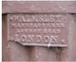
h01946 walmsley house cnr royal parade and gatehouse st parkville sign she project 2004