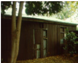
h01946 walmsley house royal park march 2001