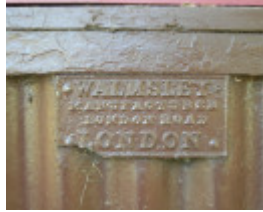
THE WALMSLEY HOUSE SOHE 2008