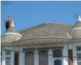
H1793 PRINCE ALBERT HOTEL LHA 2015 2.JPG