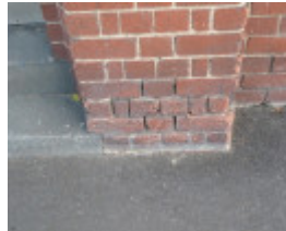
H1793 PRINCE ALBERT HOTEL LHA 2015 4.JPG