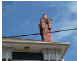
H1793 PRINCE ALBERT HOTEL LHA 2015 3.JPG