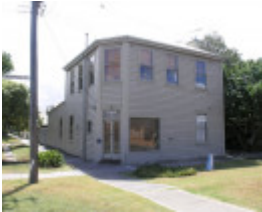
FORMER BRIDGE HOTEL SOHE 2008