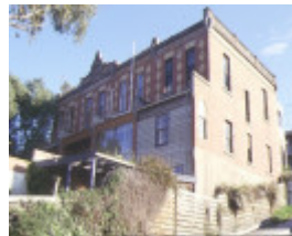
h01774 186 192 clarke street northcote rear elevation sep1998