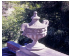
h01774 terrace houses clark street northcote rear urn she project 2004