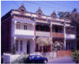
h01774 1 terrace houses clark street northcote facade she project 2004