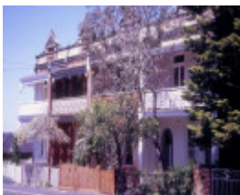
h01774 terrace houses clark street northcote street view she project 2004