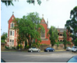
CATHOLIC COLLEGE BENDIGO SOHE 2008