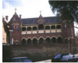
1 convent of mercy bendigo front view hall & boarders building apr1997