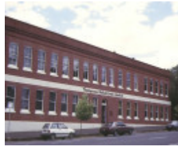
1 thompsons kelly & lewis engineering works parker street castlemaine side view jan1998