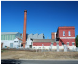
THOMPSONS KELLY & LEWIS ENGINEERING WORKS SOHE 2008