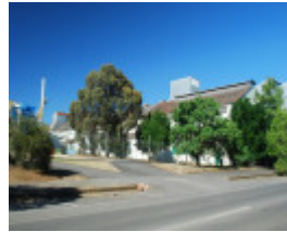
THOMPSONS KELLY & LEWIS ENGINEERING WORKS SOHE 2008