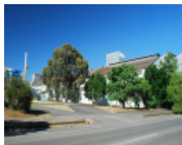
THOMPSONS KELLY & LEWIS ENGINEERING WORKS SOHE 2008