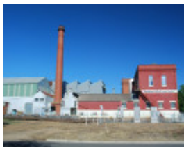
THOMPSONS KELLY & LEWIS ENGINEERING WORKS SOHE 2008