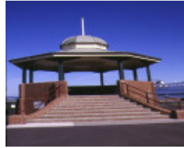
1 band rotunda beach street port melbourne front view apr1998