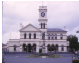
1 maryborough post office maryborough front view aug1998