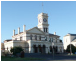
MARYBOROUGH POST OFFICE SOHE 2008