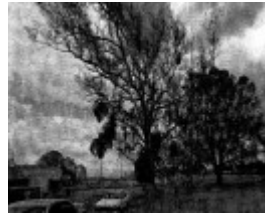
Gums opposite the Doreen store and hall