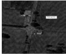
River red gums