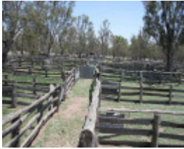
PROV H2212 Barmah Yards Dec 08 PM2