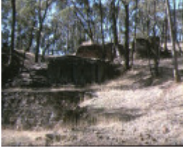
1 central cookman quartz gold mine st parkins reef road maldon landscape jun1997