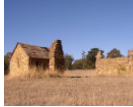
h01743 1 stone cottages blakeley road barkers creek cottage both she project 2004