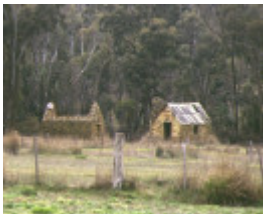
h01743 stone cottages blakely road barkers creek landscape view aug1997