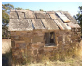
h01743 stone cottages blakeley road barkers creek cottage one side view she project 2004