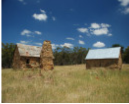
STONE COTTAGES SOHE 2008