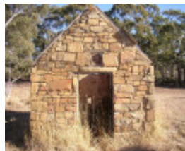
h01743 stone cottages blakeley road barkers creek cottage two front she project 2004