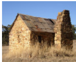
h01743 stone cottages blakeley road barkers creek cottage one chimney she project 2004