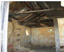
h01743 stone cottages blakeley road barkers creek cottage one interior she project 2004