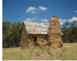
STONE COTTAGES SOHE 2008