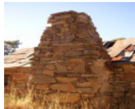
h01743 stone cottages blakeley road barkers creek cottage detached chimney bldg one she project 2004