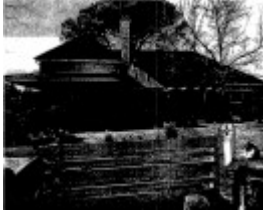
12.10 - Thornholme Residence - Shire of Whittlesea Heritage Study 1991