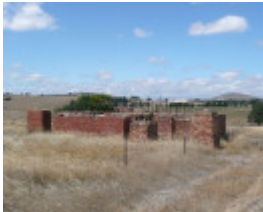
BERRY CONSOLS EXTENDED DEEP LEAD GOLD MINE SOHE 2008