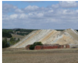
BERRY CONSOLS EXTENDED DEEP LEAD GOLD MINE SOHE 2008