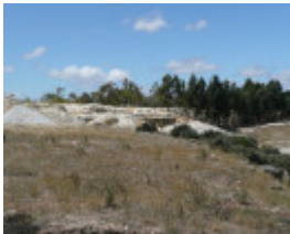
BERRY CONSOLS EXTENDED DEEP LEAD GOLD MINE SOHE 2008