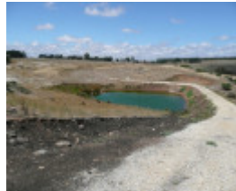
BERRY CONSOLS EXTENDED DEEP LEAD GOLD MINE SOHE 2008