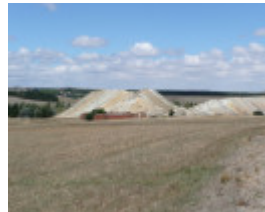
BERRY CONSOLS EXTENDED DEEP LEAD GOLD MINE SOHE 2008