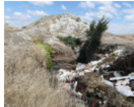
BERRY CONSOLS EXTENDED DEEP LEAD GOLD MINE SOHE 2008