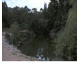
1 tronoh gold dredgiong ponds harrietville landscape