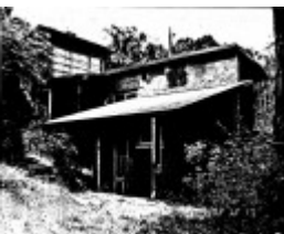
18 - Frank Werther Residence off Barreenong Rd 03 - Shire of Eltham Heritage Study 1992