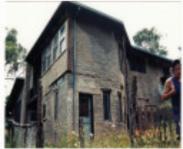
Frank Werther Residence off Barreenong Rd Colour 1 - Shire of Eltham Heritage Study 1992