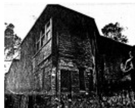
18 - Frank Werther Residence off Barreenong Rd - Shire of Eltham Heritage Study 1992