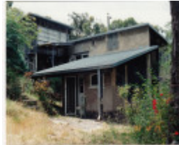
Frank Werther Residence off Barreenong Rd Colour 2 - Shire of Eltham Heritage Study 1992