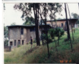
Frank Werther Residence off Barreenong Rd Colour 3 - Shire of Eltham Heritage Study 1992