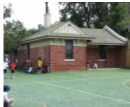
Glenferrie PS_caretakers cottage_27 Oct 07