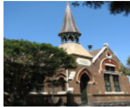
GLENFERRIE PRIMARY SCHOOL (PRIMARY SCHOOL NO.1508) SOHE 2008