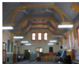
Glenferrie PS_Infants school interior_27 Oct 07