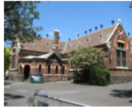
GLENFERRIE PRIMARY SCHOOL (PRIMARY SCHOOL NO.1508) SOHE 2008