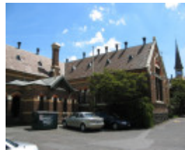
Glenferrie PS_1877 (R) & 1881 wing (L)_27 Oct 07