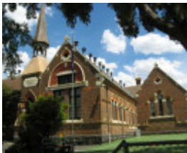
Glenferrie PS_1877 & 1887 extension_27 Oct 07