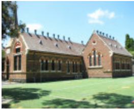
GLENFERRIE PRIMARY SCHOOL (PRIMARY SCHOOL NO.1508) SOHE 2008