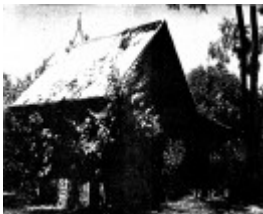
30 - Peter Garner MudBrickStudio andShed 62 Brougham St_07 - Shire of Eltham Heritage Study 1992