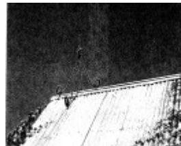
30 - Peter Garner MudBrickStudio andShed 62 Brougham St_08 - Shire of Eltham Heritage Study 1992