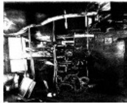
30 - Peter Garner MudBrickStudio andShed 62 Brougham St_03 - Shire of Eltham Heritage Study 1992