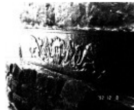
30 - Peter Garner MudBrickStudio andShed 62 Brougham St_06 - Shire of Eltham Heritage Study 1992