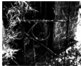
30 - Peter Garner MudBrickStudio andShed 62 Brougham St_09 - Shire of Eltham Heritage Study 1992