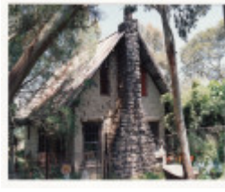
Peter Garner Mud Brick Studio and Shed 62 Brougham St Colour 1 - Shire of Eltham Heritage Study 1992