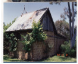
Peter Garner Mud Brick Studio and Shed 62 Brougham St Colour 7 - Shire of Eltham Heritage Study 1992