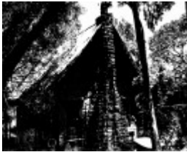
30 - Peter Garner Mud Brick Studio and Shed 62 Brougham St - Shire of Eltham Heritage Study 1992