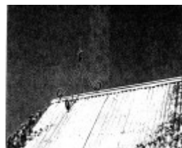
30 - Peter Garner MudBrickStudio andShed 62 Brougham St_08 - Shire of Eltham Heritage Study 1992