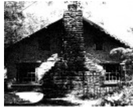
30 - Peter Garner MudBrickStudio andShed 62 Brougham St_02 - Shire of Eltham Heritage Study 1992