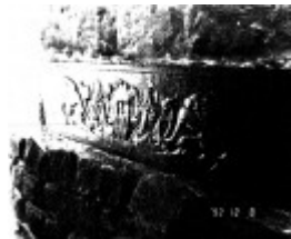
30 - Peter Garner MudBrickStudio andShed 62 Brougham St_06 - Shire of Eltham Heritage Study 1992