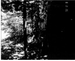
30 - Peter Garner MudBrickStudio andShed 62 Brougham St_10 - Shire of Eltham Heritage Study 1992