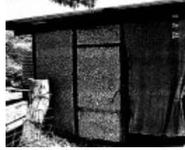
30 - Peter Garner MudBrickStudio andShed 62 Brougham St_11 - Shire of Eltham Heritage Study 1992