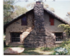
Peter Garner Mud Brick Studio and Shed 62 Brougham St Colour 8 - Shire of Eltham Heritage Study 1992