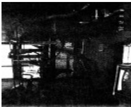
30 - Peter Garner MudBrickStudio andShed 62 Brougham St_04 - Shire of Eltham Heritage Study 1992