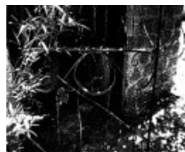
30 - Peter Garner MudBrickStudio andShed 62 Brougham St_09 - Shire of Eltham Heritage Study 1992