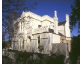
1 tudor house 52 pasco street williamstown northern elevation sep1999