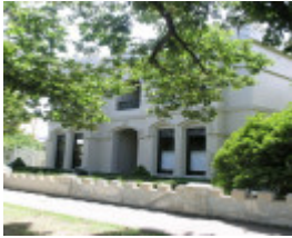
TUDOR HOUSE SOHE 2008