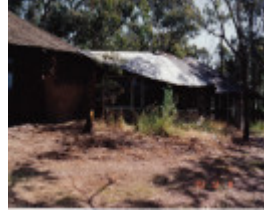
Leon Saper Residence 60 Dunmoochin Rd Colour 4 - Shire of Eltham Heritage Study 1992