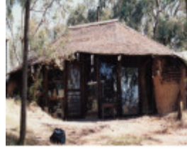
Leon Saper Residence 60 Dunmoochin Rd Colour 6 - Shire of Eltham Heritage Study 1992