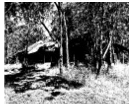
58 - Leon Saper Residence 60 Dunmoochin Rd_06 - Shire of Eltham Heritage Study 1992