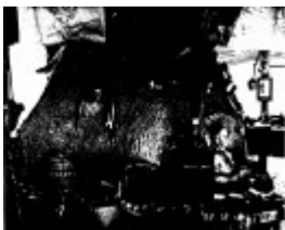
58 - Leon Saper Residence 60 Dunmoochin Rd_07 - Shire of Eltham Heritage Study 1992