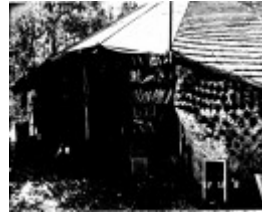
58 - Leon Saper Residence 60 Dunmoochin Rd_03 - Shire of Eltham Heritage Study 1992