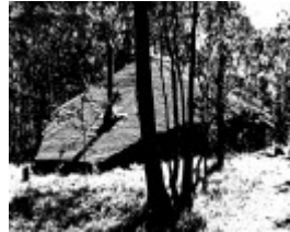
58 - Leon Saper Residence 60 Dunmoochin Rd_02 - Shire of Eltham Heritage Study 1992