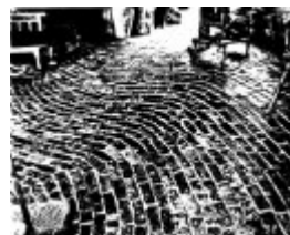
58 - Leon Saper Residence 60 Dunmoochin Rd_09 - Shire of Eltham Heritage Study 1992