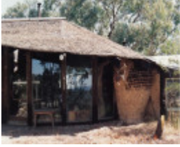
Leon Saper Residence 60 Dunmoochin Rd Colour 3 - Shire of Eltham Heritage Study 1992