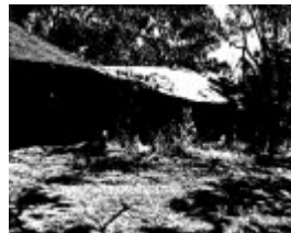
58 - Leon Saper Residence 60 Dunmoochin Rd_05 - Shire of Eltham Heritage Study 1992