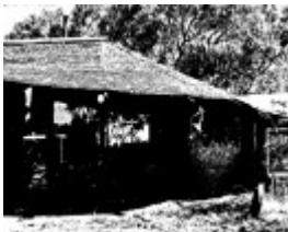
58 - Leon Saper Residence 60 Dunmoochin Rd_04 - Shire of Eltham Heritage Study 1992