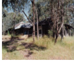
Leon Saper Residence 60 Dunmoochin Rd Colour 5 - Shire of Eltham Heritage Study 1992