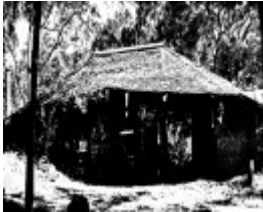
58 - Leon Saper Residence 60 Dunmoochin Rd - Shire of Eltham Heritage Study 1992