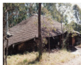
Leon Saper Residence 60 Dunmoochin Rd Colour 1 - Shire of Eltham Heritage Study 1992