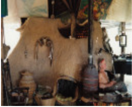
HO41 Leon Saper Residence - 60 Dunmoochin Road Cottles Bridge 7.jpg