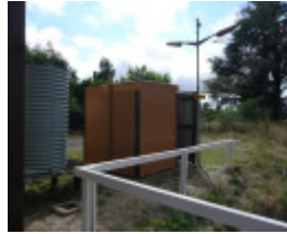
GORDON RAILWAY STATION SOHE 2008