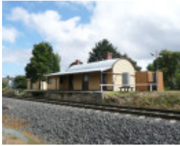
GORDON RAILWAY STATION SOHE 2008