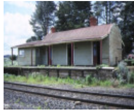
1 gordon railway station gowrie street gordon platform view nov1986