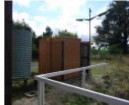
GORDON RAILWAY STATION SOHE 2008