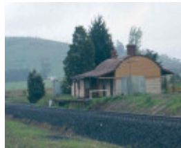
Gordon Railway Station 2004