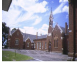
1 primary school number 1566 bendigo front view feb1993