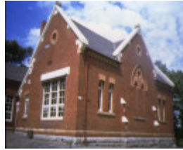
primary school number 1566 side view jan1993