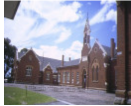
1 primary school number 1566 bendigo front view feb1993