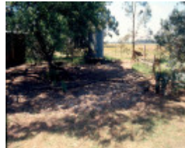
H01984 insitu horseworks kyneton3