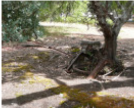
INSITU HORSEWORKS SOHE 2008