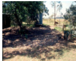
H01984 insitu horseworks kyneton3