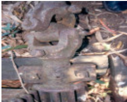
H01984 insitu horseworks kyneton2