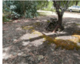
INSITU HORSEWORKS SOHE 2008