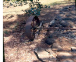
H01984 insitu horseworks kyneton1