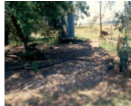
H01984 insitu horseworks kyneton4