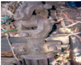
H01984 insitu horseworks kyneton2