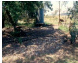
H01984 insitu horseworks kyneton4