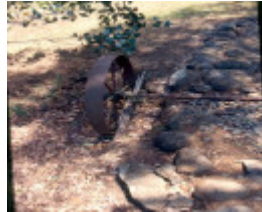
H01984 insitu horseworks kyneton1