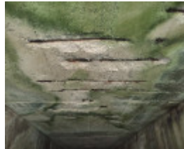
H1819 LOWER GOODWOOD KILNS LHA 2015 3.jpeg