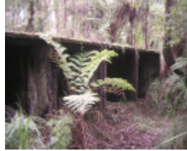
1 lower goodwood kilns upper l;a trobe valley piedmont front view aug1998