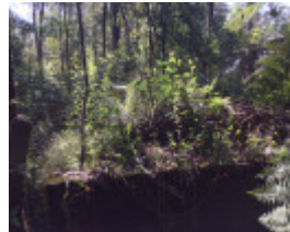
H1819 LOWER GOODWOOD KILNS LHA 2015 2.jpeg