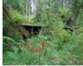
LOWER GOODWOOD KILNS SOHE 2008