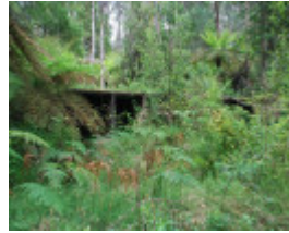
LOWER GOODWOOD KILNS SOHE 2008