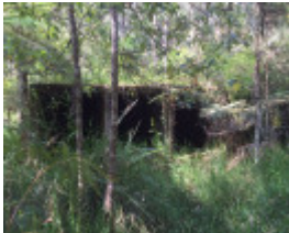
H1819 LOWER GOODWOOD KILNS LHA 2015 1.jpeg