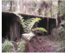
1 lower goodwood kilns upper l;a trobe valley piedmont front view aug1998