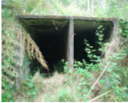
LOWER GOODWOOD KILNS SOHE 2008