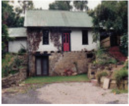
Souter House 19 Falkiner St Eltham Colour 3 - Shire of Eltham Heritage Study 1992