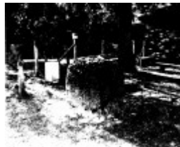
81 - Hurst Family Cemetery Greysarps Rd_06 - Shire of Eltham Heritage Study 1992