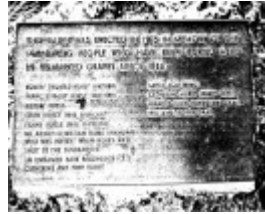
81 - Hurst Family Cemetery Greysarps Rd_02 - Shire of Eltham Heritage Study 1992