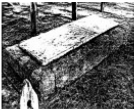
81 - Hurst Family Cemetery Greysarps Rd_04 - Shire of Eltham Heritage Study 1992