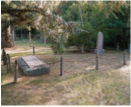
Hurst Family Cemetery Greys Harps Rd Colour 1 - Shire of Eltham Heritage Study 1992