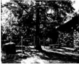
81 - Hurst Family Cemetery Greysarps Rd - Shire of Eltham Heritage Study 1992