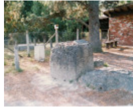
Hurst Family Cemetery Greys Harps Rd Colour 3 - Shire of Eltham Heritage Study 1992