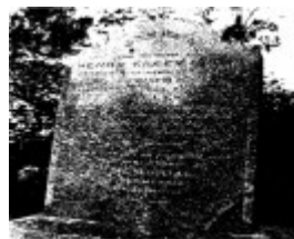
81 - Hurst Family Cemetery Greysarps Rd_08 - Shire of Eltham Heritage Study 1992