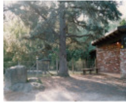
Hurst Family Cemetery Greys Harps Rd Colour 7 - Shire of Eltham Heritage Study 1992