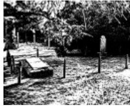
81 - Hurst Family Cemetery Greysarps Rd_03 - Shire of Eltham Heritage Study 1992