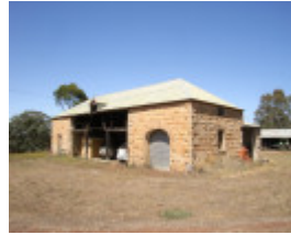
GRINGEGALGONA HOMESTEAD SOHE 2008