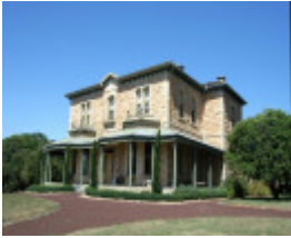
GRINGEGALGONA HOMESTEAD SOHE 2008