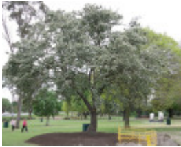
1_Azarole tree replanted in Victory Park