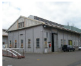
Before Photograph - Reference F3916 2014