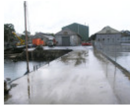
FORMER MELBOURNE HARBOUR TRUST WILLIAMSTOWN WORKSHOPS SOHE 2008