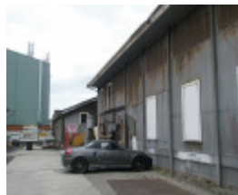
Before Photograph - Reference F3916 2014