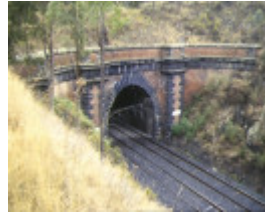
1 elphinstone railway precinct elphinstone side elevation of bridge