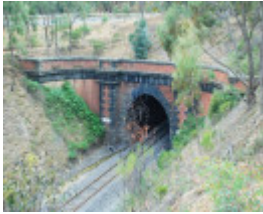
ELPHINSTONE RAILWAY PRECINCT SOHE 2008