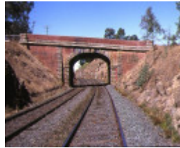
1 porcupine hill railway precinct ravenswood bridge front view apr1998