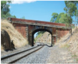
PORCUPINE HILL RAILWAY PRECINCT (MURRAY VALLE RLWY, MELB TO ECHUCA) SOHE 2008