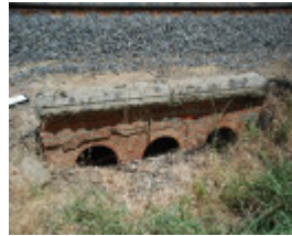
PORCUPINE HILL RAILWAY PRECINCT (MURRAY VALLE RLWY, MELB TO ECHUCA) SOHE 2008