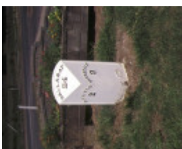
cast iron mileposts cape clear 4