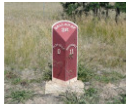
CAST IRON MILEPOSTS SOHE 2008