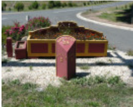
CAST IRON MILEPOSTS SOHE 2008