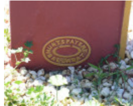
CAST IRON MILEPOSTS SOHE 2008