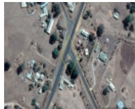
Milepost B - aerial diagram