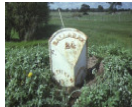
1 cast iron mileposts cape clear 1