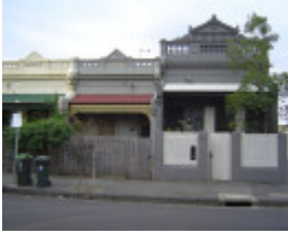
Barkly Street West Precinct