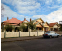
Edmends Street, Brunswick.JPG