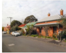
Louisa Street, Brunswick(1).JPG