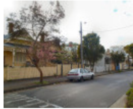
Stewart Street, Brunswick.JPG