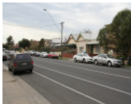
Dawson St looking E.JPG