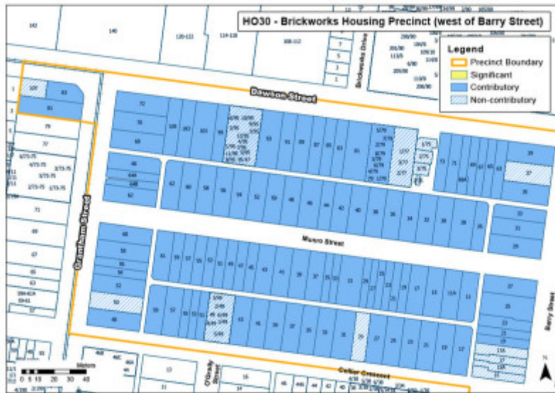
Brickworks Housing Precinct (west of Barry Street)