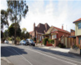
Daly St looking N