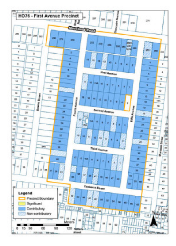
First Avenue Precinct Map