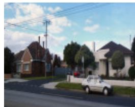
Melville road between Princes and Brearley Coburg