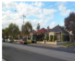
Melville Road and Princes Terrace Coburg