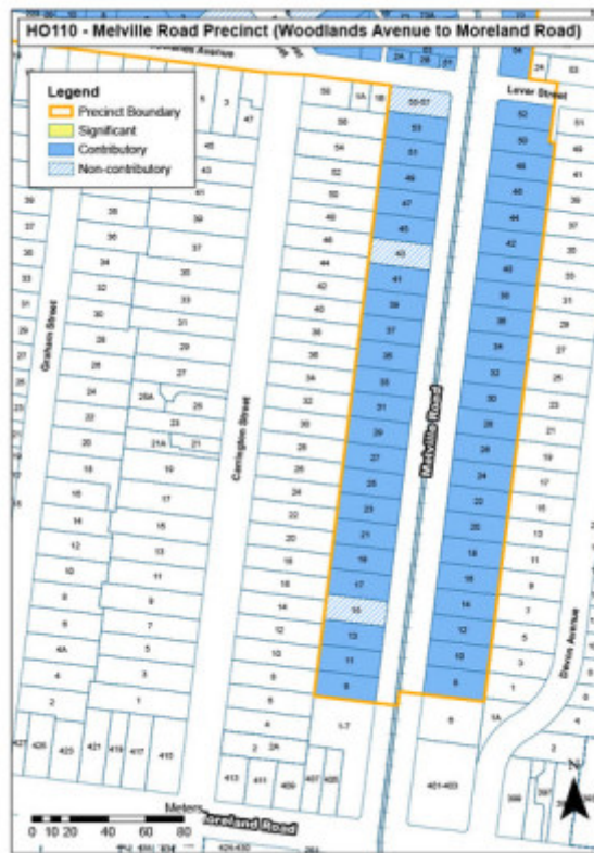
Melville Road Precinct (Woodlands Avenue to Moreland Road) Map