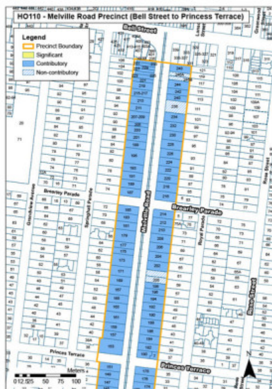
Melville Road Precinct (Bell Street to Princess Terrace) Map