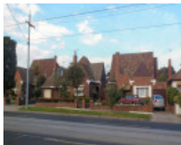
Melville road between Princes and Brearley Coburg