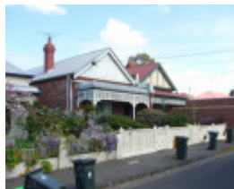
Willowbank Rd (2)