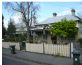
Willowbank Rd (1)