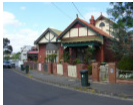
Willowbank Rd (3)