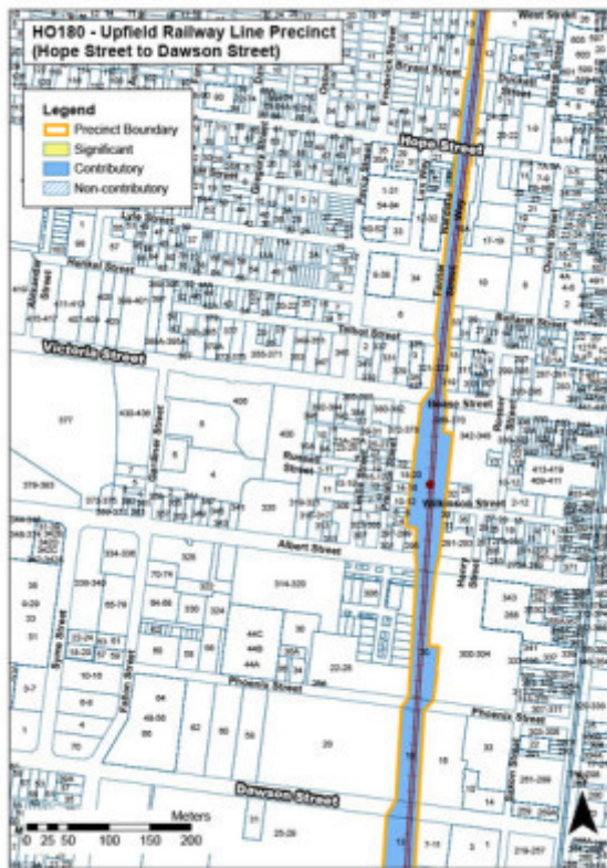
Upfield Railway Line Precinct 4 Map (Hope Street to Dawson Street)