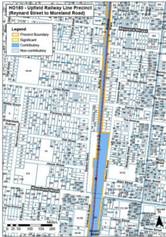
Upfield Railway Line Precinct 2 Map (Reynard Street to Moreland Road)