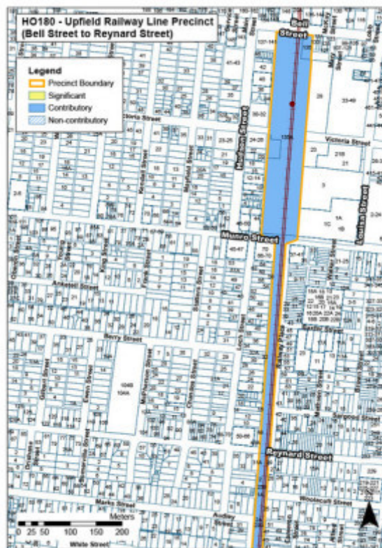
Upfield Railway Line Precinct 1 Map (Bell Street to Reynard Street)