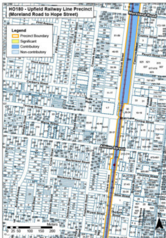
Upfield Railway Line Precinct 3 Map (Moreland Road to Hope Street)