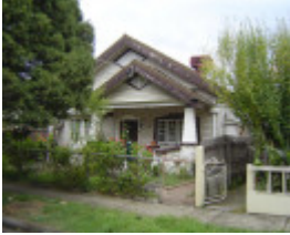
French Avenue Precinct