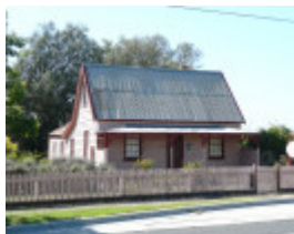
GERMAN COTTAGE SOHE 2008