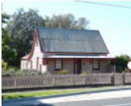
GERMAN COTTAGE SOHE 2008