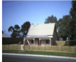
1 german cottage torquay road grovedale front view sep1991