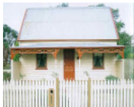
german cottage torquay road grovedale front view publication