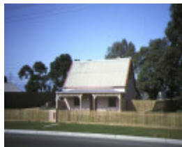
1 german cottage torquay road grovedale front view sep1991