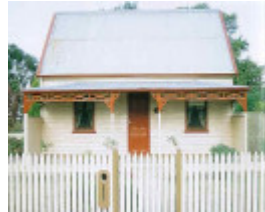
german cottage torquay road grovedale front view publication