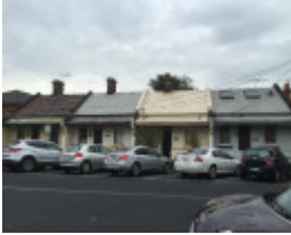
163-169 Barkly St Brunswick East