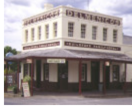
1 guildford hotel music hall & stables midland hwy guildford front view of hotel