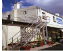
guildford hotel music hall & stables midland hwy guildford rear view of hotel