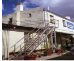
guildford hotel music hall & stables midland hwy guildford rear view of hotel