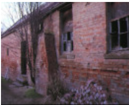
guildford hotel music hall & stables midland hwy guildford side view of music hall