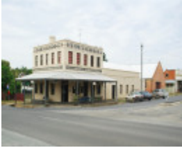
GUILDFORD HOTEL MUSIC HALL AND STABLES SOHE 2008