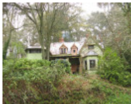
Fontainebleau_view from north_KJ_Sept 09