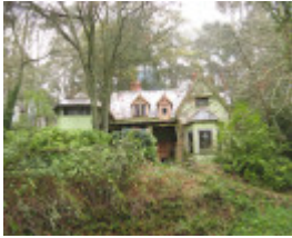
Fontainebleau_view from north_KJ_Sept 09