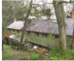
Fontainebleau_guest house wing from south_KJ_Sept 09