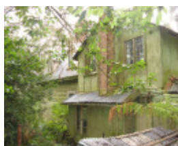
Fontainebleau_west end of rear guest house wing_KJ_Sept 09