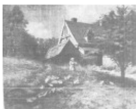
Fontainebleau_as painted by McCubbin