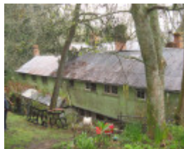
Fontainebleau_guest house wing from south_KJ_Sept 09