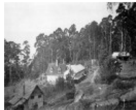
McCubbin_fontainebleau early photo c1920.jpg