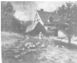
Fontainebleau_as painted by McCubbin