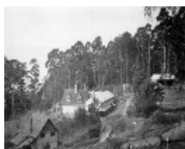
McCubbin_fontainebleau early photo c1920.jpg