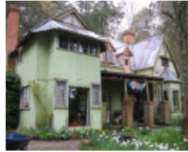
Fontainebleau_view from front with second guest house wing on left_KJ_Sept 09