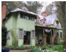
Fontainebleau_view from front with second guest house wing on left_KJ_Sept 09