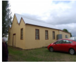
H2173 Black Lead Former Methodist Church and Hall 6