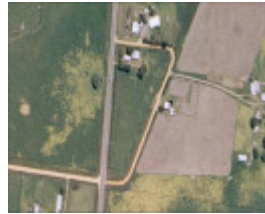
H2173 black lead aerial