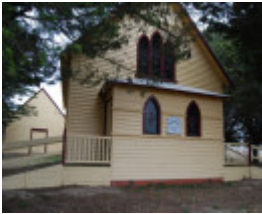
H2173 Black Lead Former Methodist Church may 2008 compressed