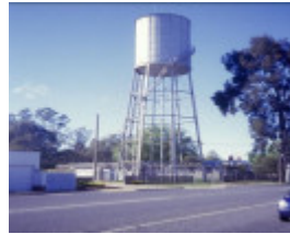
h01833 water tower and tank millard street wangaratta view from street she project 2003