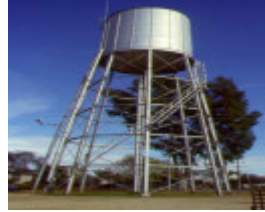
1 water tower and tank millard st wangaratta may 99 pm1