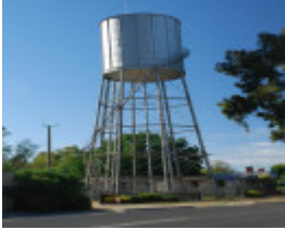
WATER TOWER AND TANK SOHE 2008