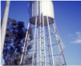
h01833 water tower and tank millard street wangaratta tower and pipeworks she project 2003