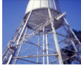
h01833 water tower and tank millard street wangaratta close up she project 2003