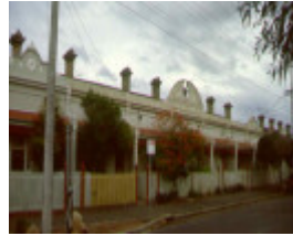
1 queens terrace nott st port melbourne ac2 may1999