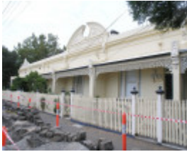
QUEENS TERRACE SOHE 2008