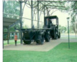
1 big lizzie