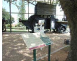
BIG LIZZIE SOHE 2008