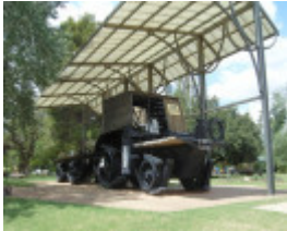
BIG LIZZIE SOHE 2008